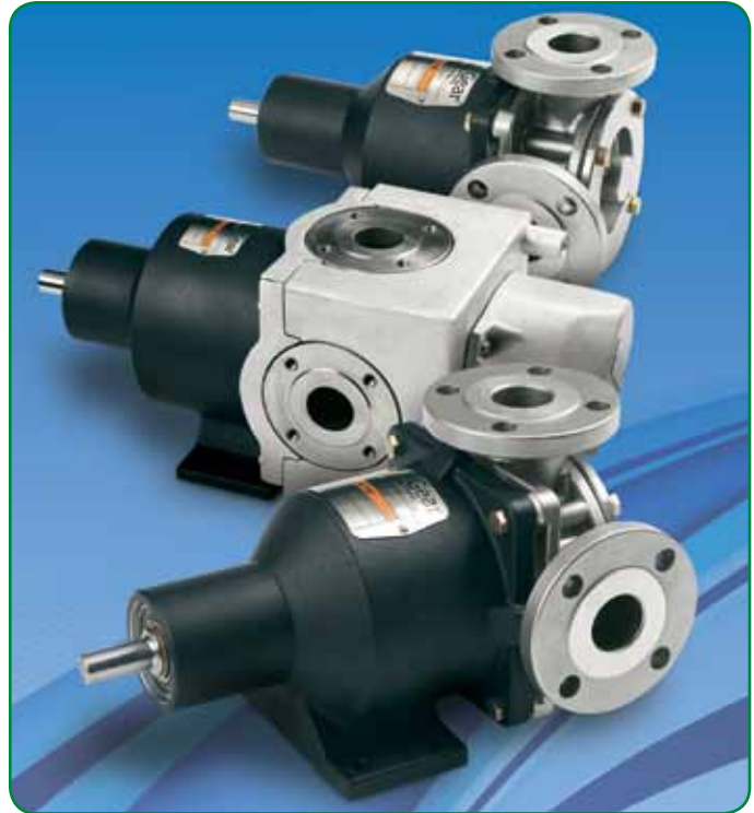
EnviroGear® offers a complete family of Seal-less Internal Gear Pumps.

The design of the EnviroGear Seal-Less Internal Gear Pump makes it an engineered solution for environmentally