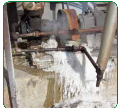
These are a few examples of what can go wrong when pump styles with inadequate product-sealing capabilities are used in resin-handling applications.